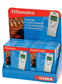
Counter display fits 6 tester

Large display to read exact value of your breath (3 colour backlight)